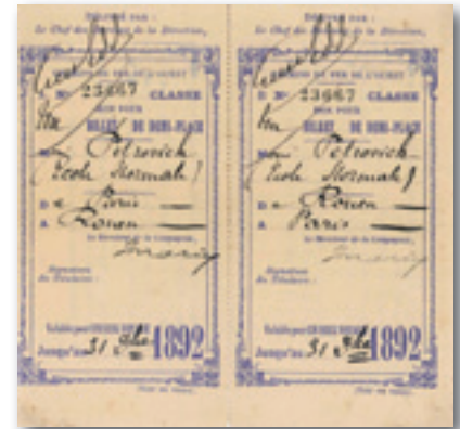
A Paris-Rouen ticket, with Petrović's name, 1892.