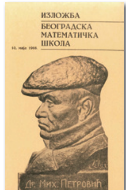
The cover page of the catalog for the exhibition organized in the Archive of Serbia, in 1968.

The guidelines or instructions for archival research attempt to give users an overview of archival, library or museum holdings and collections in certain historiographical contexts, as well as to make research more efficient. These instructions are mostly composed by collection holders, for example, archives, libraries or museums. The following describes the research of archival materials on