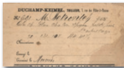
The slip to Petrović's name, for having a suit made at the tailors' in Paris, around 1890–1894.

Petrović from the point of view of one researcher. The focus is on materials held in small, and to the broader academic community unknown, "archives," such as the archive of the Association Adligat, Foundation "Mihailo Petrović Alas" and the archive of the SASA Mathematical Institute. A review of the materials held by the two state archives: the Archive of the Serbian Academy of Sciences and Arts (SASA) and the Archive of Serbia, is also provided.