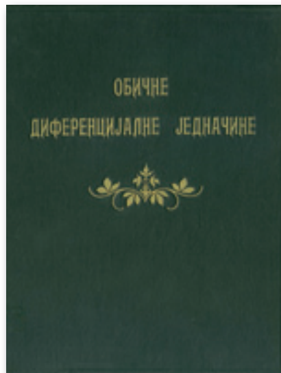
The front cover page of the book of notes taken from Professor Petrović's lectures on the ordinary differential equations, around 1910–1914.

The SASA Archive holds over 120 Petrović's photographs. Even though they were classified into two separate halves, no individual entries were made and there is no accompanying description of persons or events, or time and place of origin, apart from some anonymous notes. The assessment of the author of this article is that they cover the period from 1885 to 1941 and thematically encompass family and school photographs, military photographs from the time of Balkan wars and the First World War, group photographs with fellow university professors and scientists, as well as photographs taken when fishing, travel photographs and those with the musical band "SUZ." A part of these photographs was scanned in 2003 and preserved on a CD, which is accessible to users of the Archive. In addition to photographs, Petrović's legacy also encompasses several letters and manuscripts. Special materials are minutes from the meetings of the Academy of Natural Sciences and the Presidency of the Serbian Royal Academy, which testify about the election of Petrović for an academician and his work as the representative of the Academy. These minutes were published in Serbian Royal Academy Yearbooks for the period after 1896.