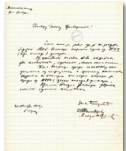
The petition written by Mihailo Petrović and Milutin Milanković on behalf of the Mathematics Seminar of the Faculty of Philosophy, to the Provost of the Belgrade University, on December 3, 1919 (Archive of Serbia, Faculty of Philosophy, G-208, III, 1919)