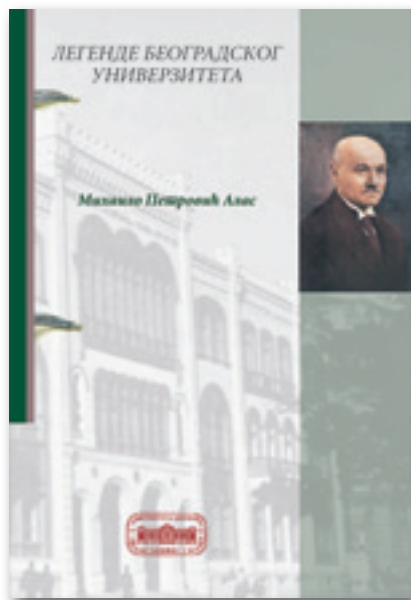
The cover page of the catalog for the exhibition organized in the University Library "Svetozar Marković," in 2003.