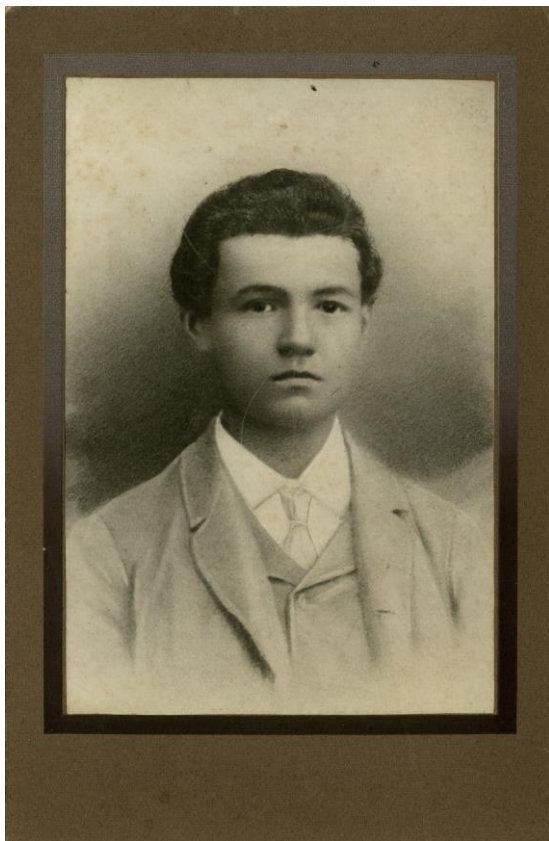
Fig 1 Mihailo Petrović as a graduate student of the First Belgrade Gymnasium, 1885

In June and July 1890, Mihailo Petrović takes the entrance exam to the prestigious L'Ecole Normale Supérieure in Paris. He passed the exam with the highest marks and began his studies at one of Europe's top schools of mathematics.